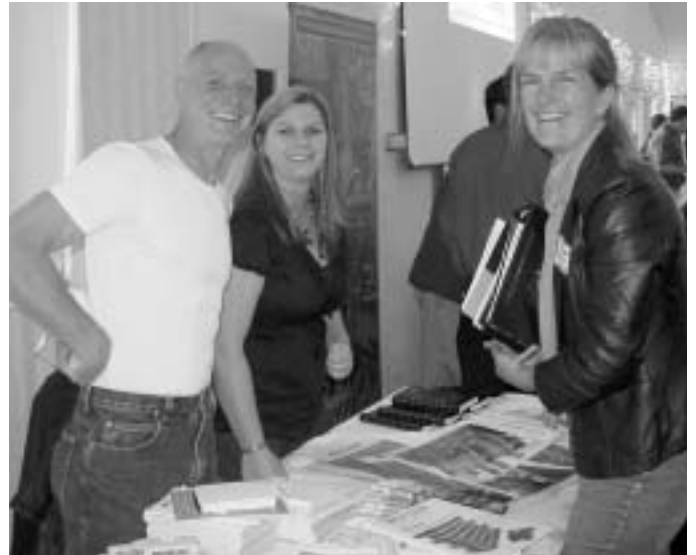
At right: McNear Brick & Block

As always, our suppliers came up with some great drawing prizes. As a bonus for their generosity, they were allowed to tell a little bit about their company before drawing the winning ticket for their prize. What a great way to promote your business to a captive audience! Lots of folks went home with some really great prizes.