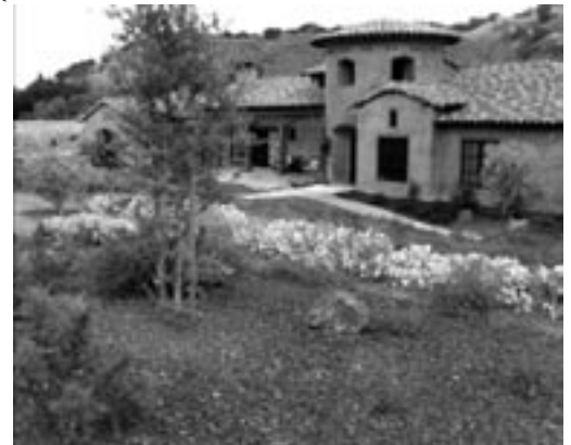
Sweepstakes Award-winning Ullbrich Property, created by Houle Landscape